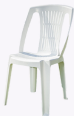
PLASTIC CHAIR 5 €