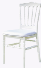
NAPOLEON CHAIR 8 €