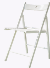
CEREMONY CHAIR 6 €