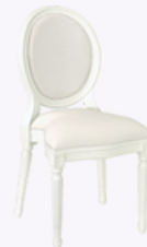
MONTAIGNE CHAIR 38 €